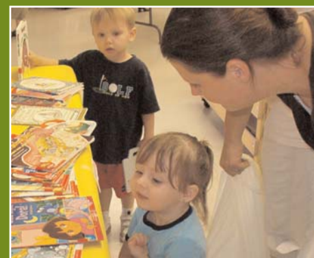
Each child had the opportunity to choose twenty books and more than 1,000 books were added to the Nexus library.