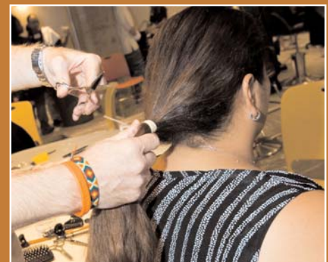
One brave client agreed to a dramatic new look by having most of her hair cut.