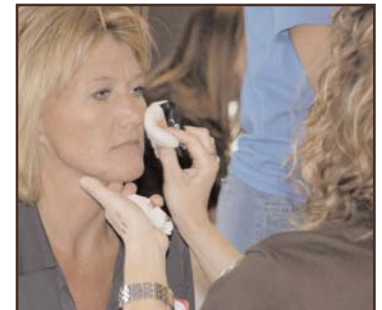
A volunteer applies make-up to a Nexus client.

More than 115 volunteers - including 50 stylists from several local salons, students from Velma B's, make-up artists, manicurists, massage therapists, a dentist, an ophthalmologist and others - pampered 80 Nexus residential, outpatient and after-