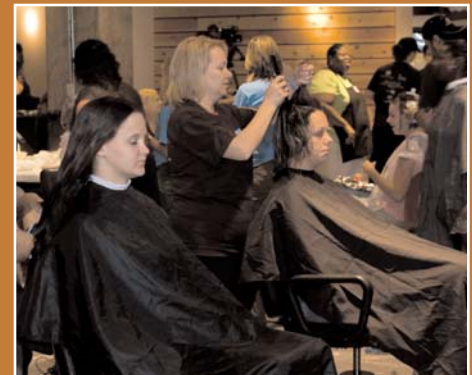
Volunteers from Watermark Community Church shampooed clients' hair and then sent them on to the stylists for cut and color.