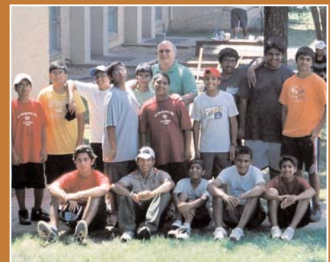
Samin raised all the funds necessary to purchase the materials and enlisted the volunteers needed to make the project a success. The final product includes new flower beds and plants, along with a walking path for moms and kids.