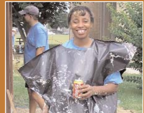
A volunteer tries to protect herself from paint.