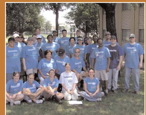
Many thanks to all the wonderful Deloitte volunteers.