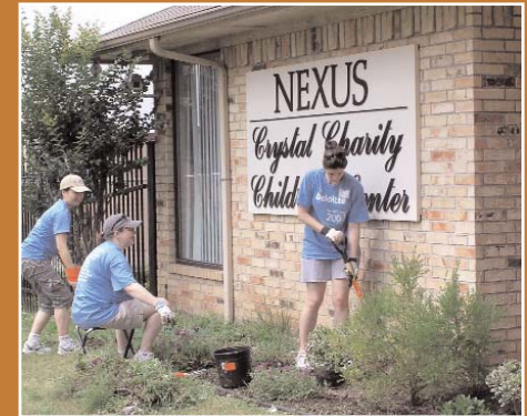
Deloitte volunteers plant flowers in front of the Crystal Charity Children's Center.